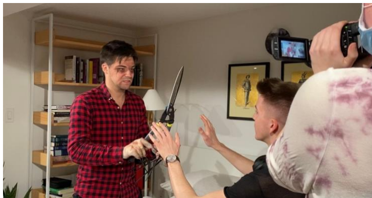
GER340-students shooting Der Strunzel (March 2022).